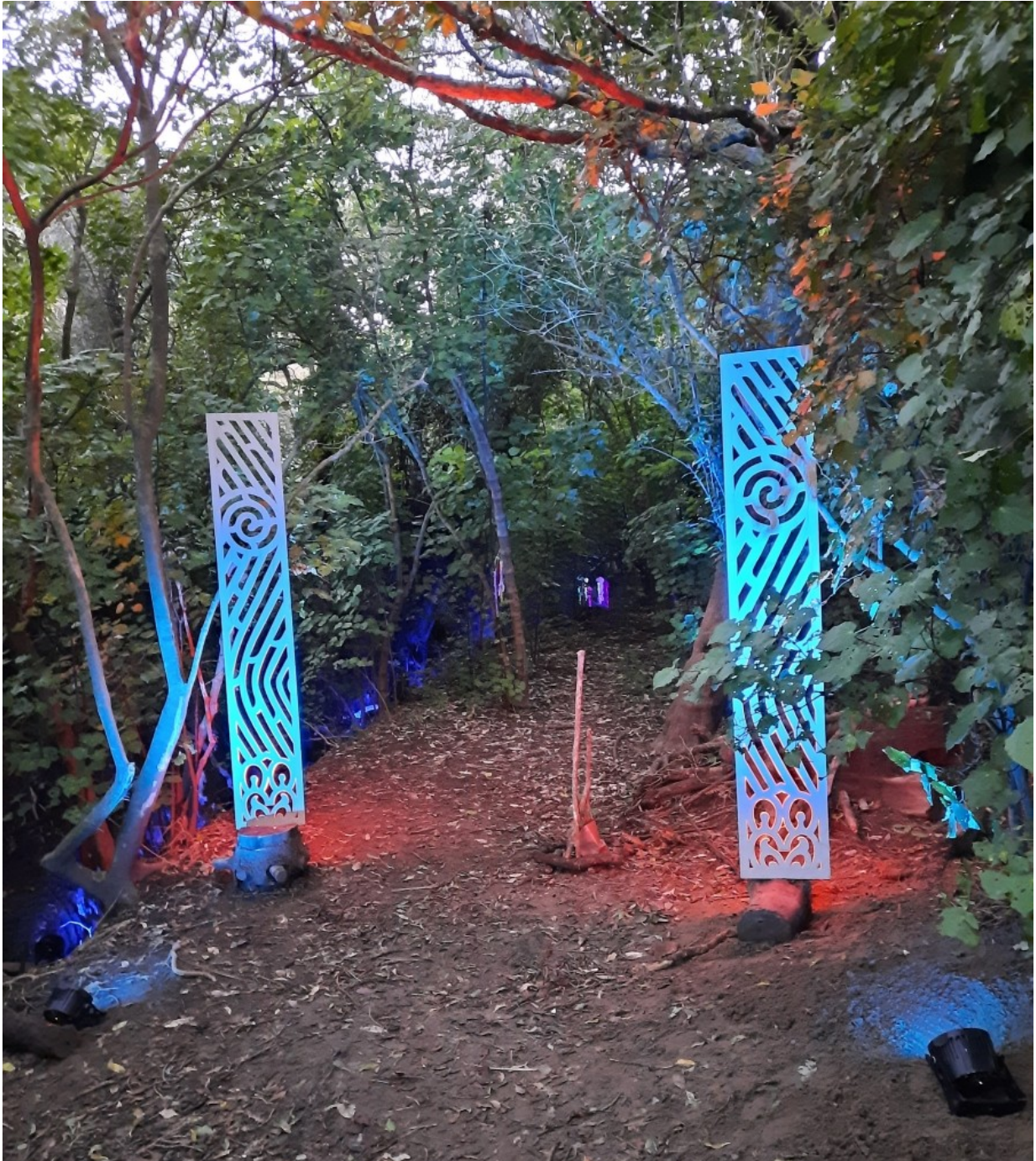
Matariki, 2022.