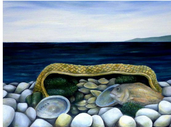
Kai Moana by Lucy Bowen, 2013 (oil on canvas).

With your food basket and my food basket the people will thrive.