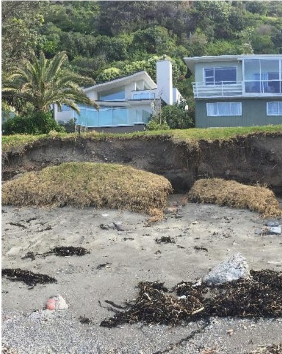
Coastal erosion, Ocean Parade.