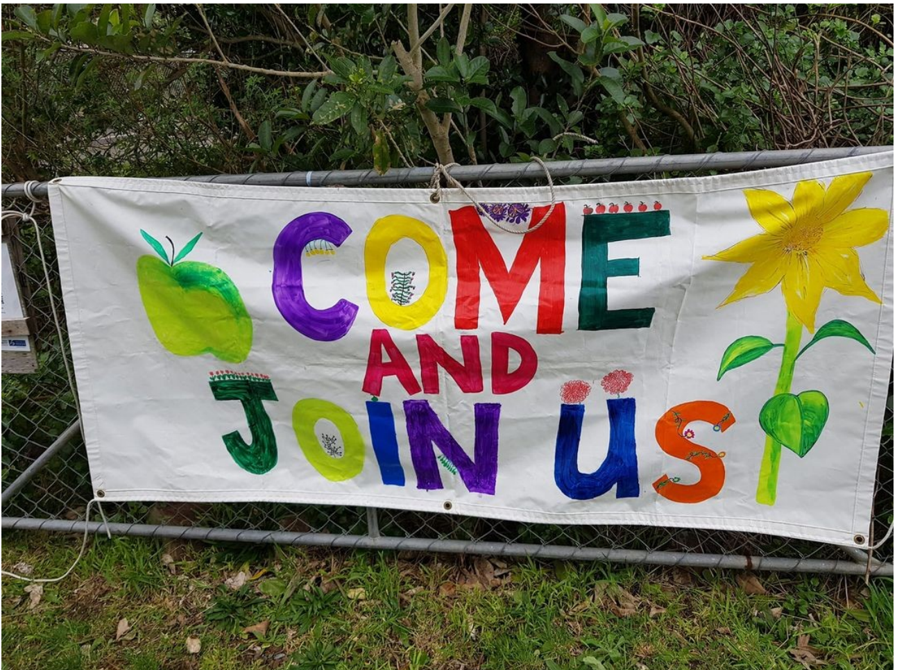
Pukerua Community Garden & Food Forest.