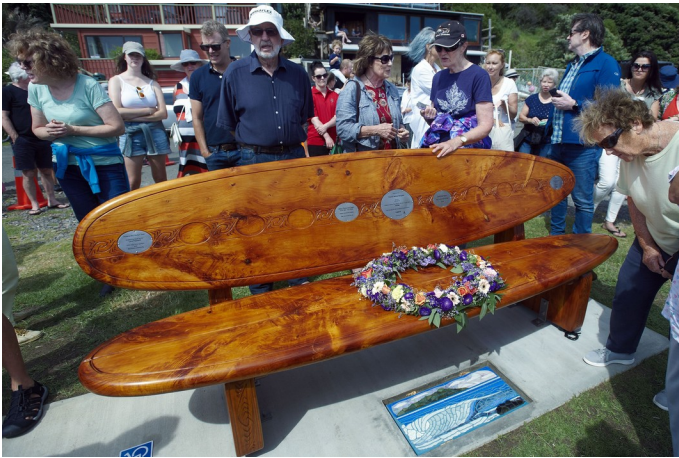
Surfers Seat