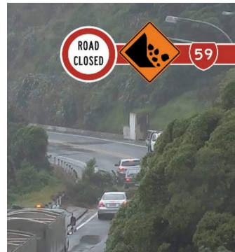
Tree trimming berms; SH59 slip.