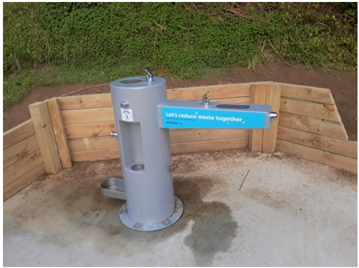
Greedy & Co. café; Water fountain installed near skate park.