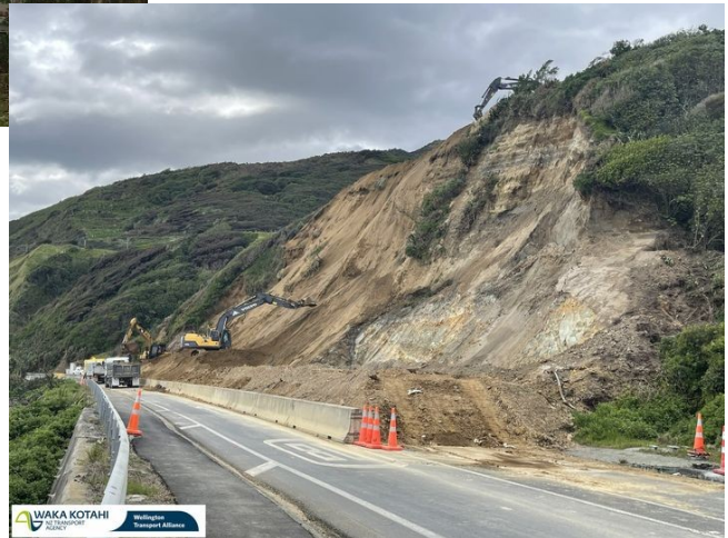
Pukerua Bay Library; SH59 slip repair, 2022.