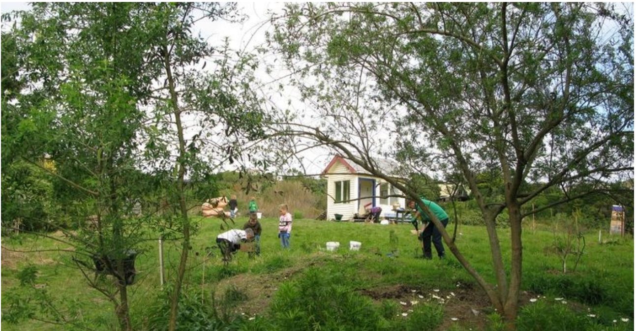
Community Garden & Food Forest, Muri Reserve.